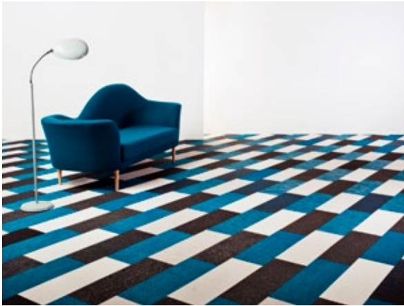
Bolon Create Fabrico, Artisan Petroleum and Artisan Ivory

Design your own flooring using the Bolon Tile Design Tool or visit our website for more inspiration.