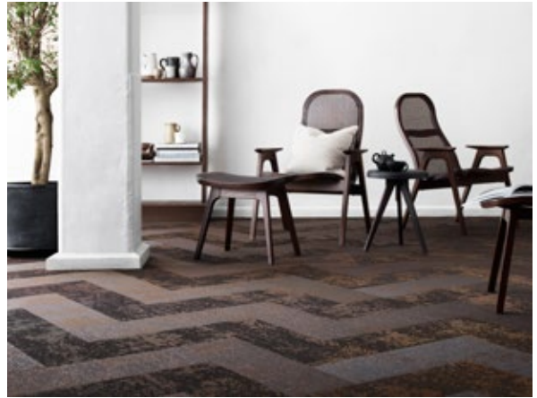
Bolon Create Comar