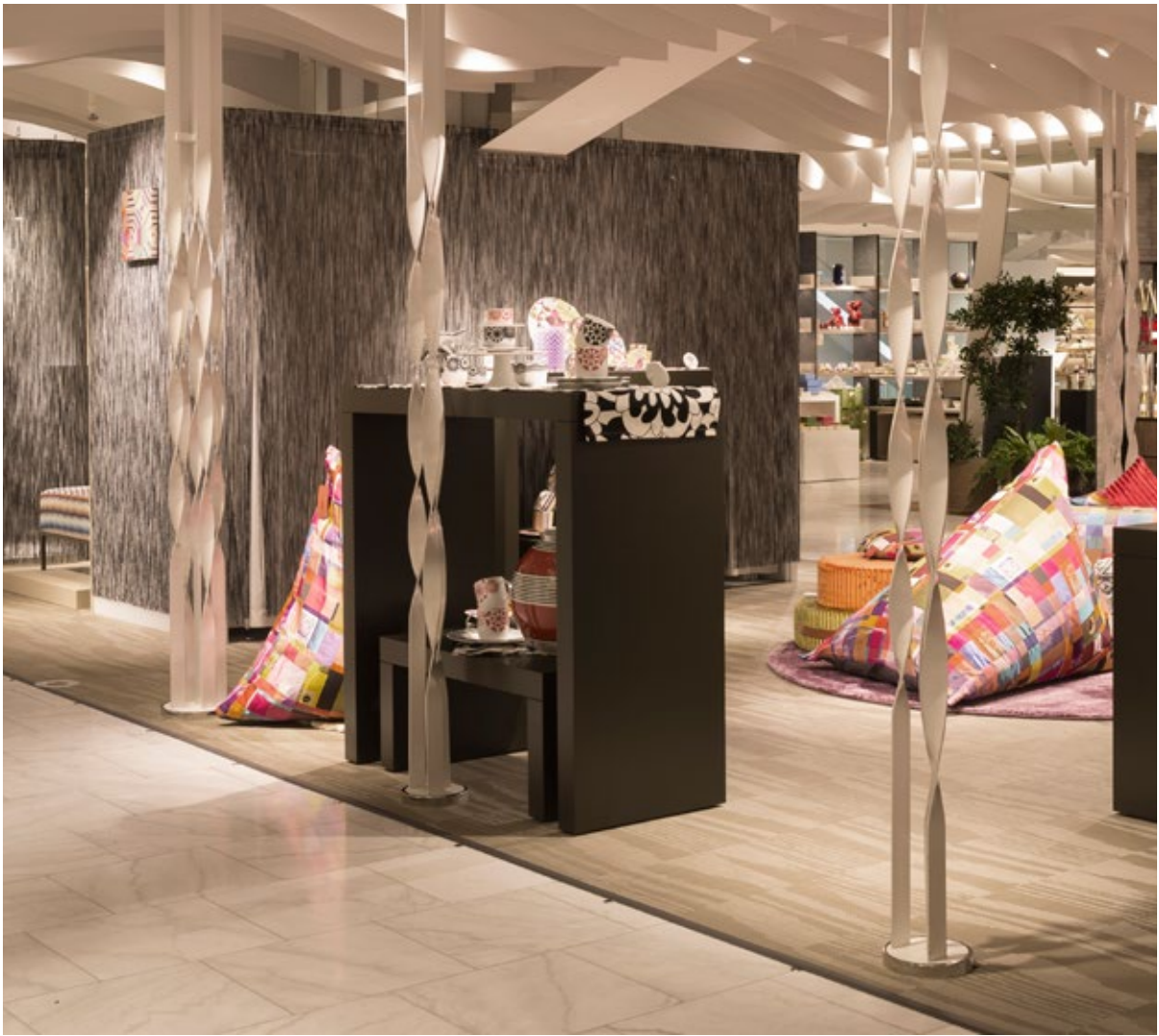
Bolon Missoni Flame Stone