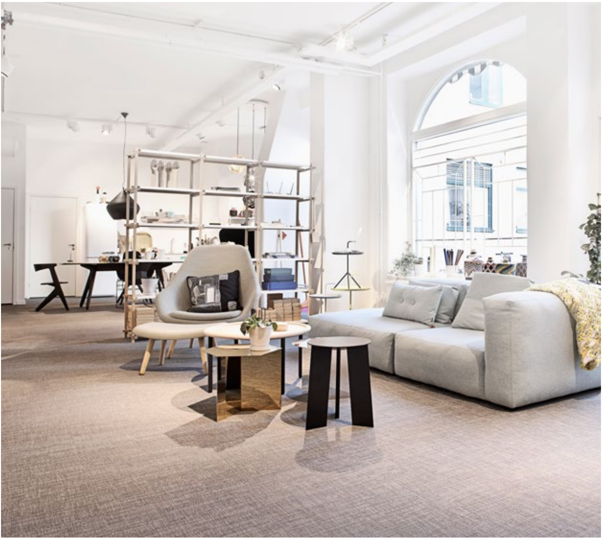
Bolon Silence Visual