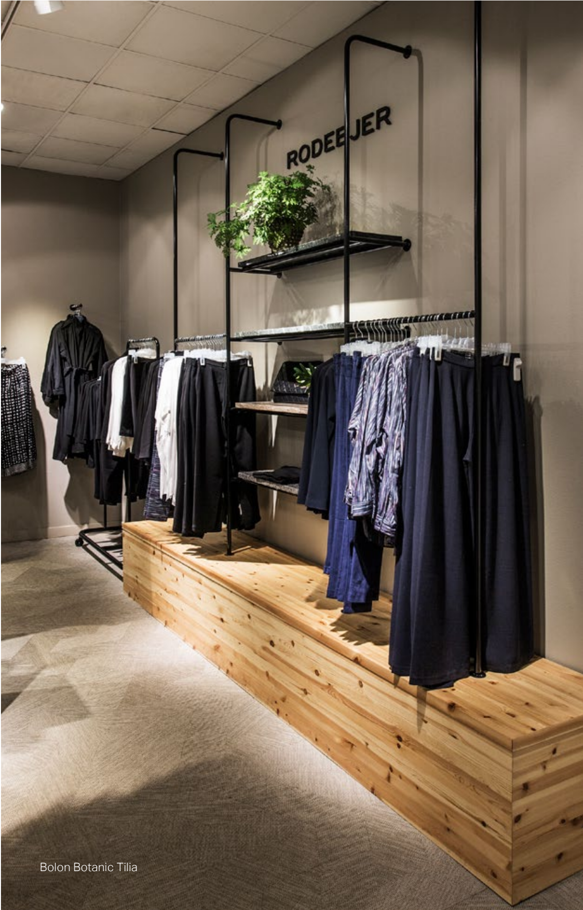
Bolon Botanic Tilia