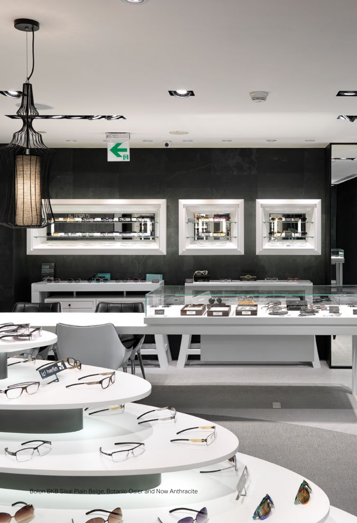
Bolon BKB Sisal Plain Beige, Botanic Osier and Now Anthracite