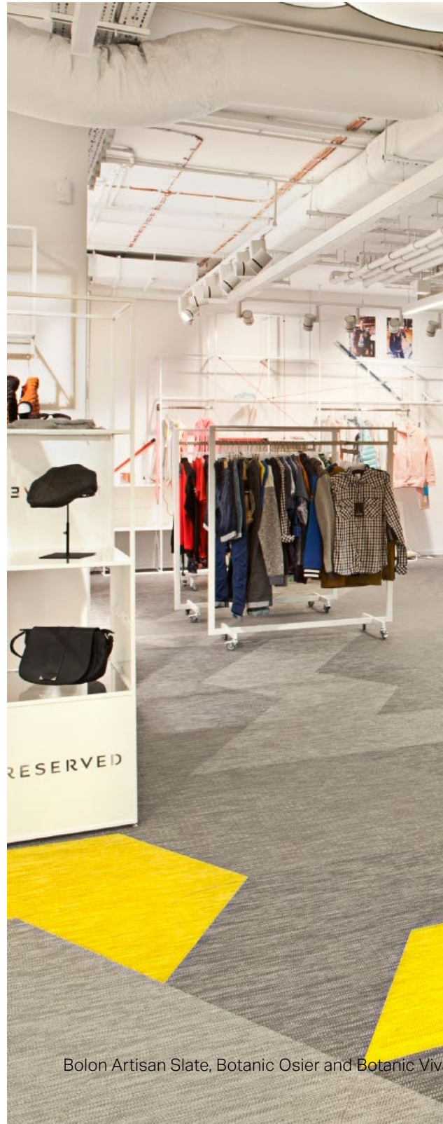
Bolon Artisan Slate, Botanic Osier and Botanic Vivid

Bolon collections include over 100 articles, available in a variety of textures, colours, patterns and formats, including both rolls and tiles. In addition to the limitless aesthetic options offered in the standard product line, Bolon offers designer collections and bespoke programs, designed to meet specific project and application demands.