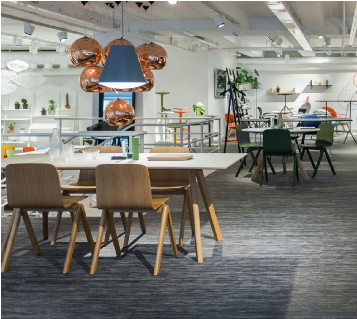
Bolon Graphic Gradient Black