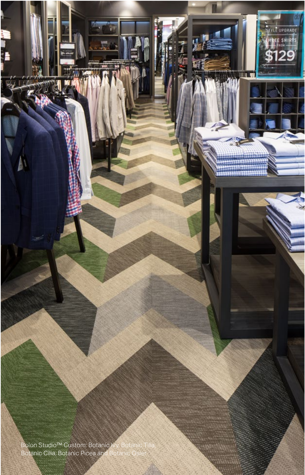
Bolon Studio™ Custom: Botanic Ivy, Botanic Tilia, Botanic Cilia, Botanic Picea and Botanic Osier