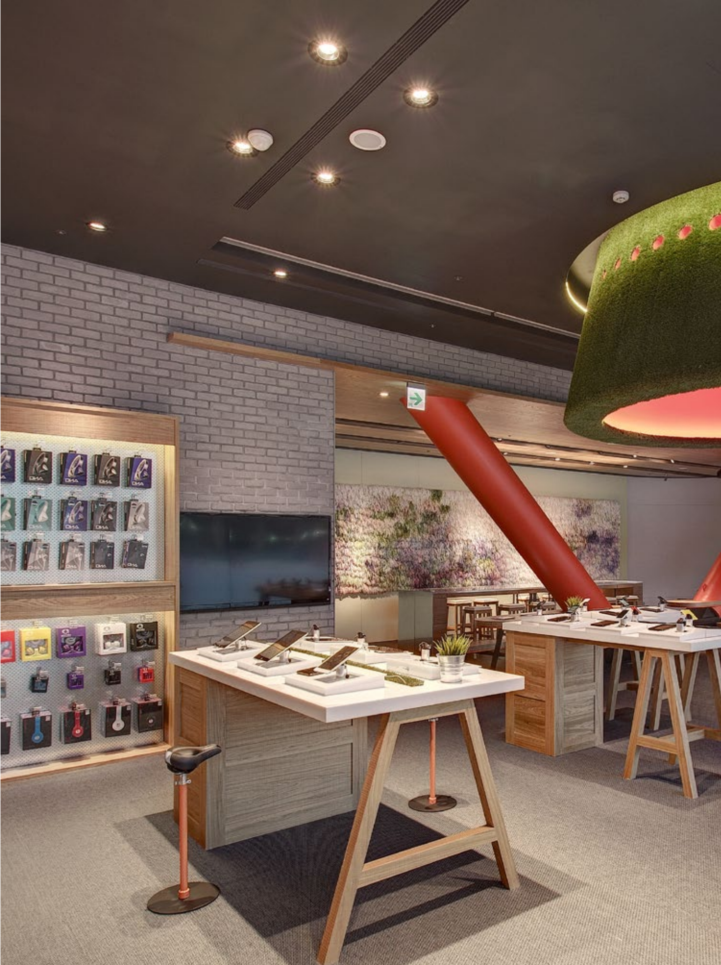
Bolon Botanic Osier and BKB Trend Metallic Alpha