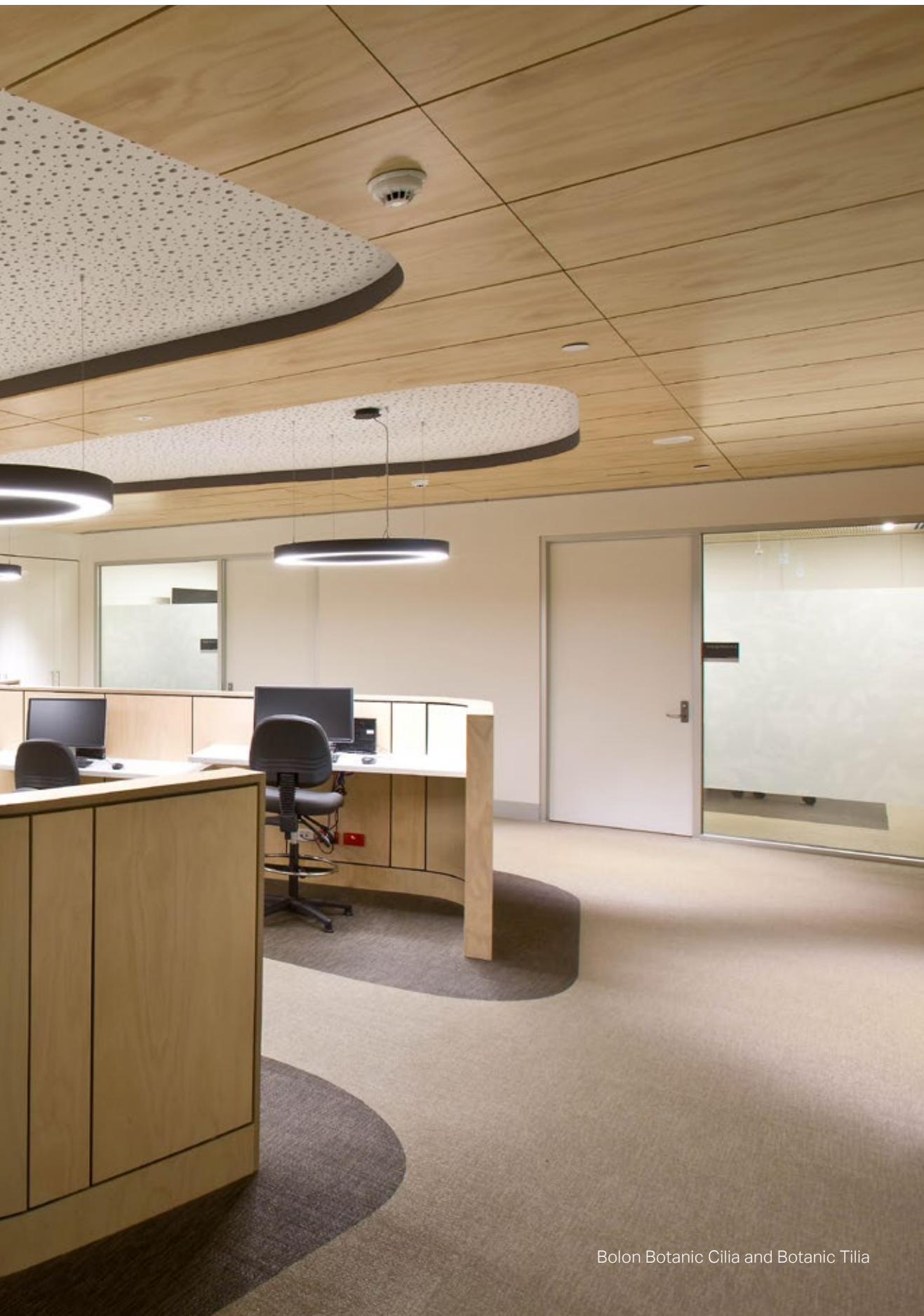
Bolon Botanic Cilia and Botanic Tilia