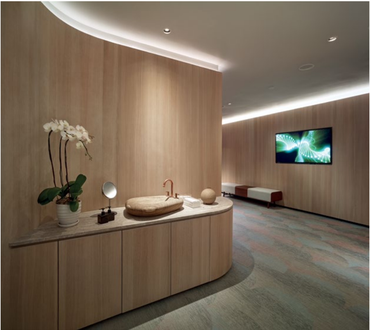
Bolon Studio™ Scale: Flow Coral and Flow Stream