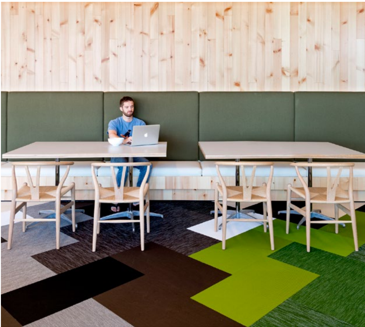
Bolon Studio™ Rectangle: Artisan Slate, Artisan Coal, Botanic Osier, Botanic Ivy, Graphic String, BKB Sisal Plain Beige and BKB Sisal Plain Mole