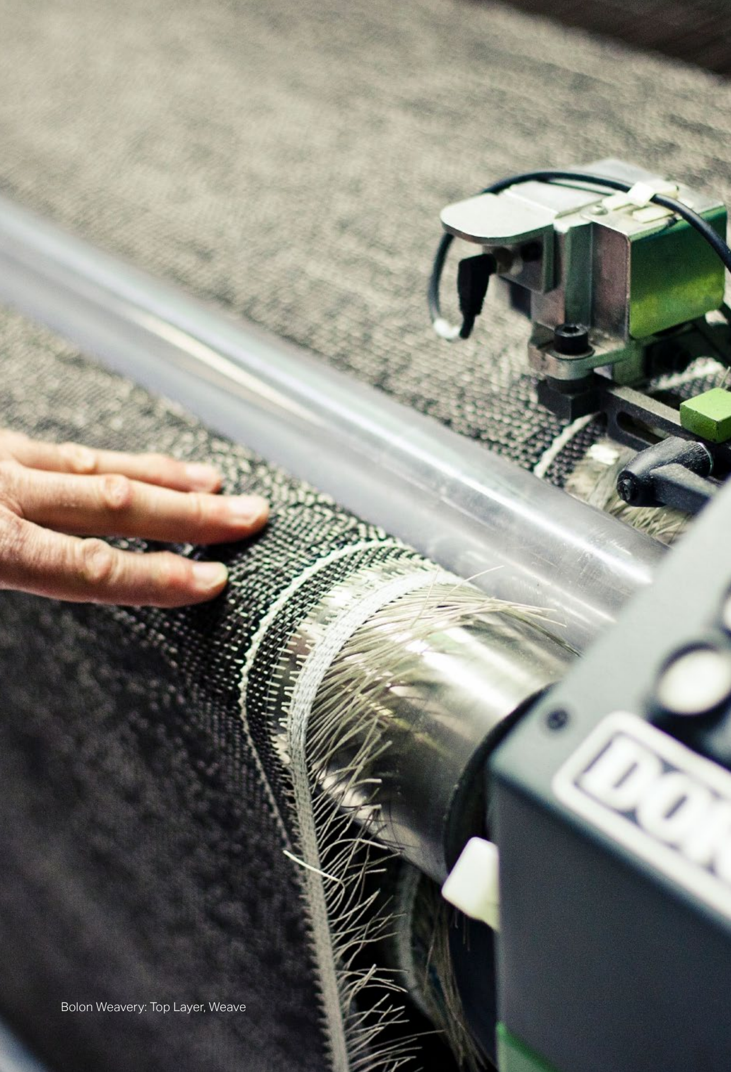
Bolon Weavery: Top Layer, Weave