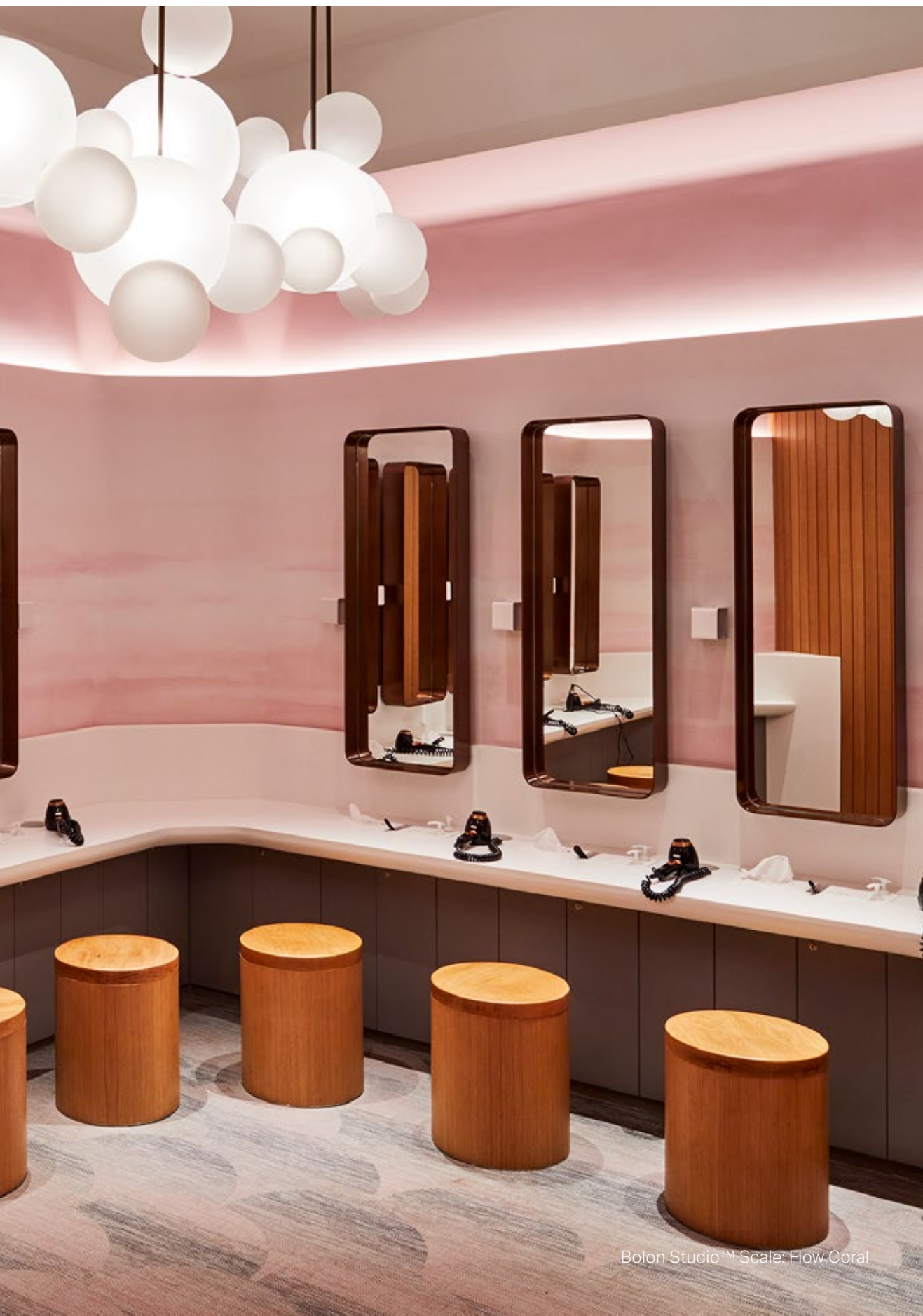
Bolon Studio™ Scale: Flow Coral