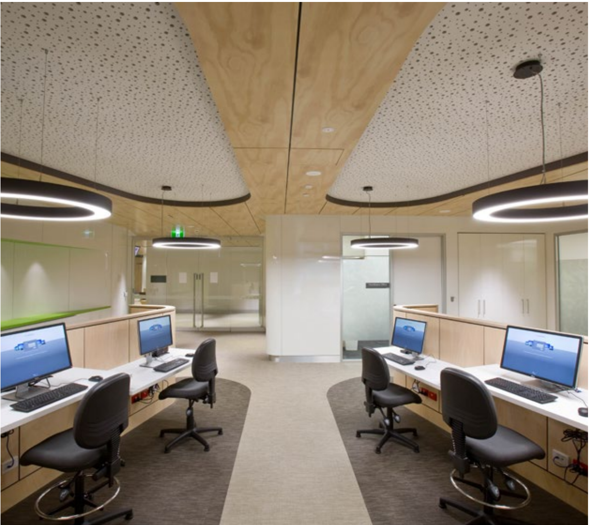
Bolon Botanic Cilia and Botanic Tilia