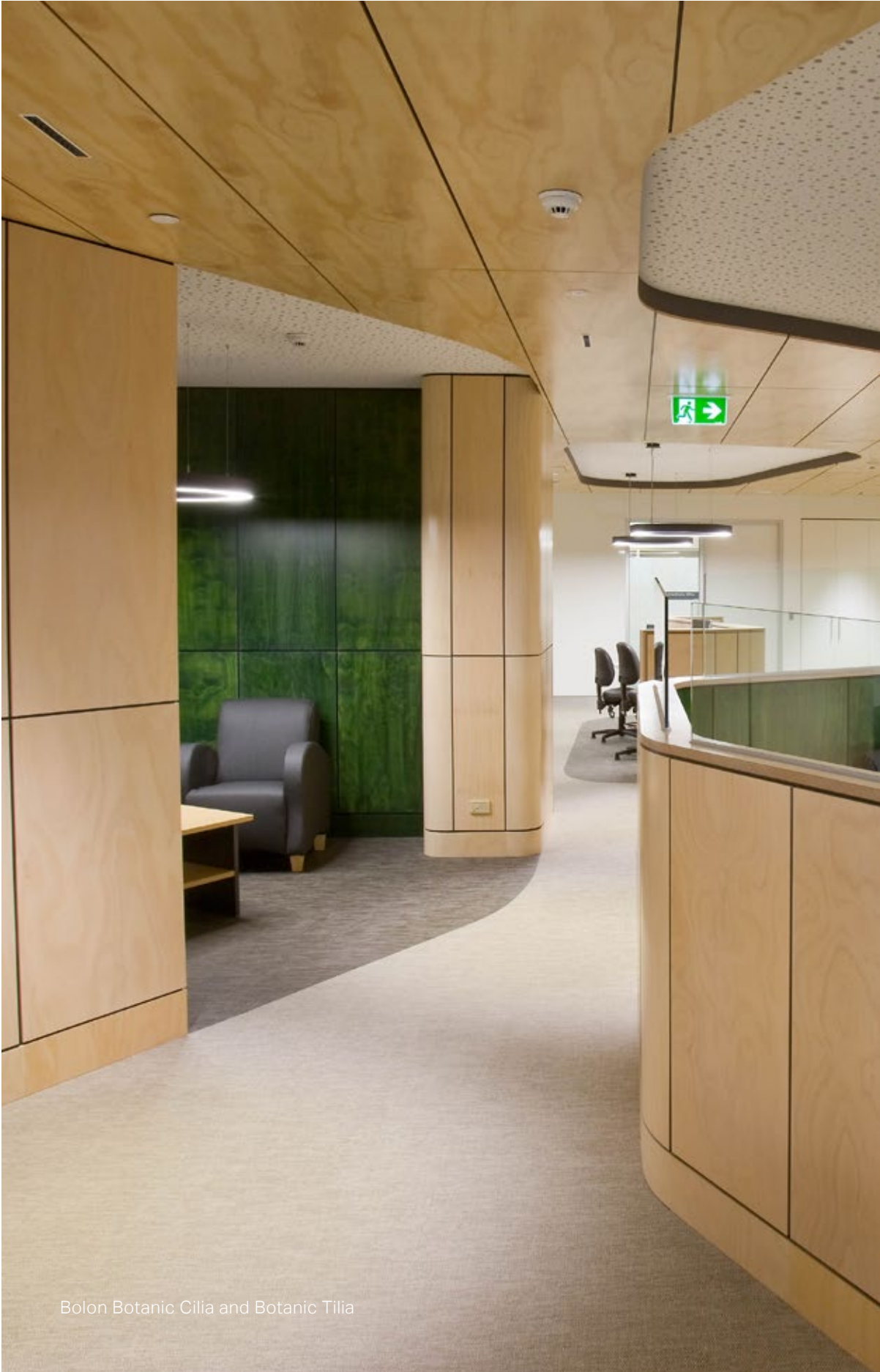
Bolon Botanic Cilia and Botanic Tilia