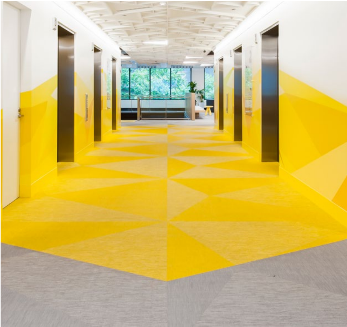
Bolon Botanic Viva and Botanic Osier