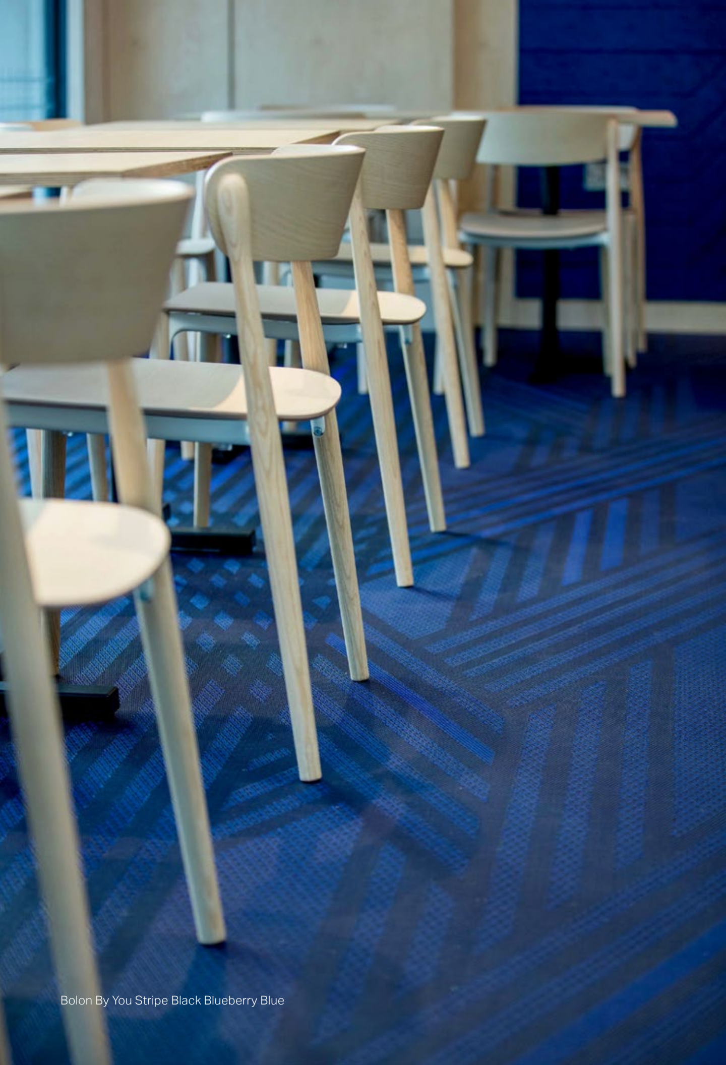
Bolon By You Stripe Black Blueberry Blue