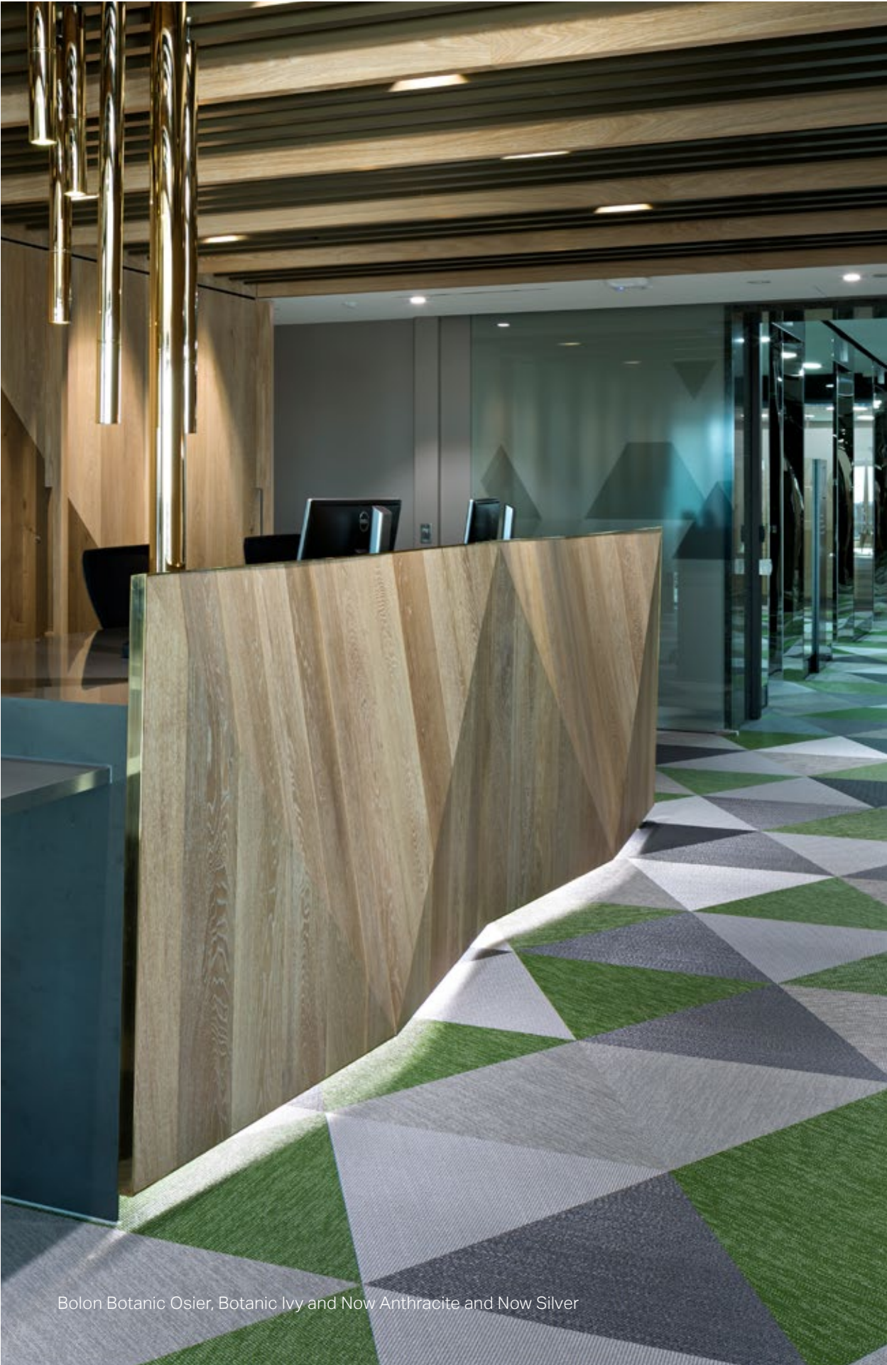
Bolon Botanic Osler, Botanic Ivy and Now Anthracite and Now Silver