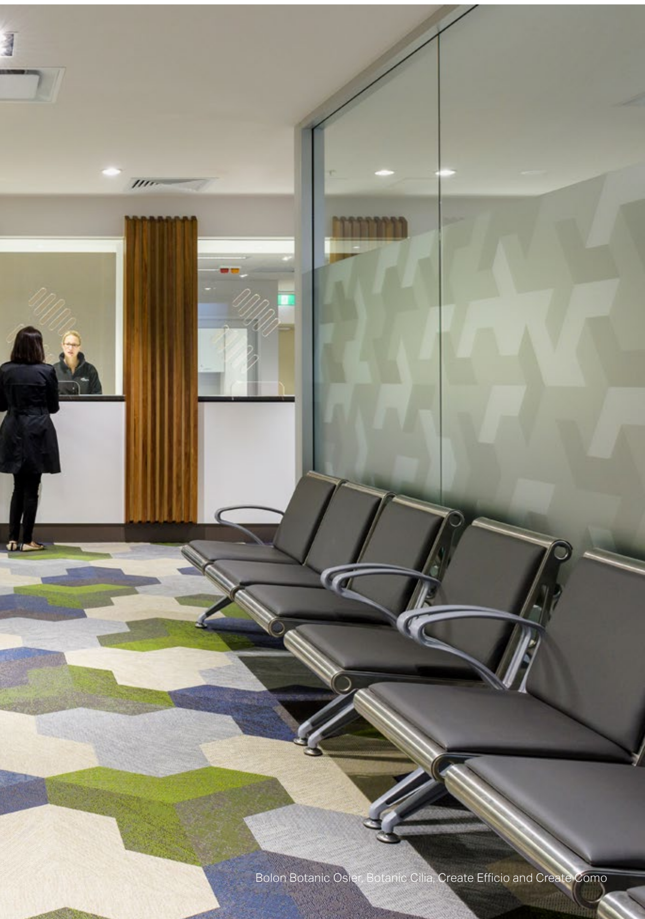
Bolon Botanic Osier, Botanic Cilia, Create Efficio and Create Como