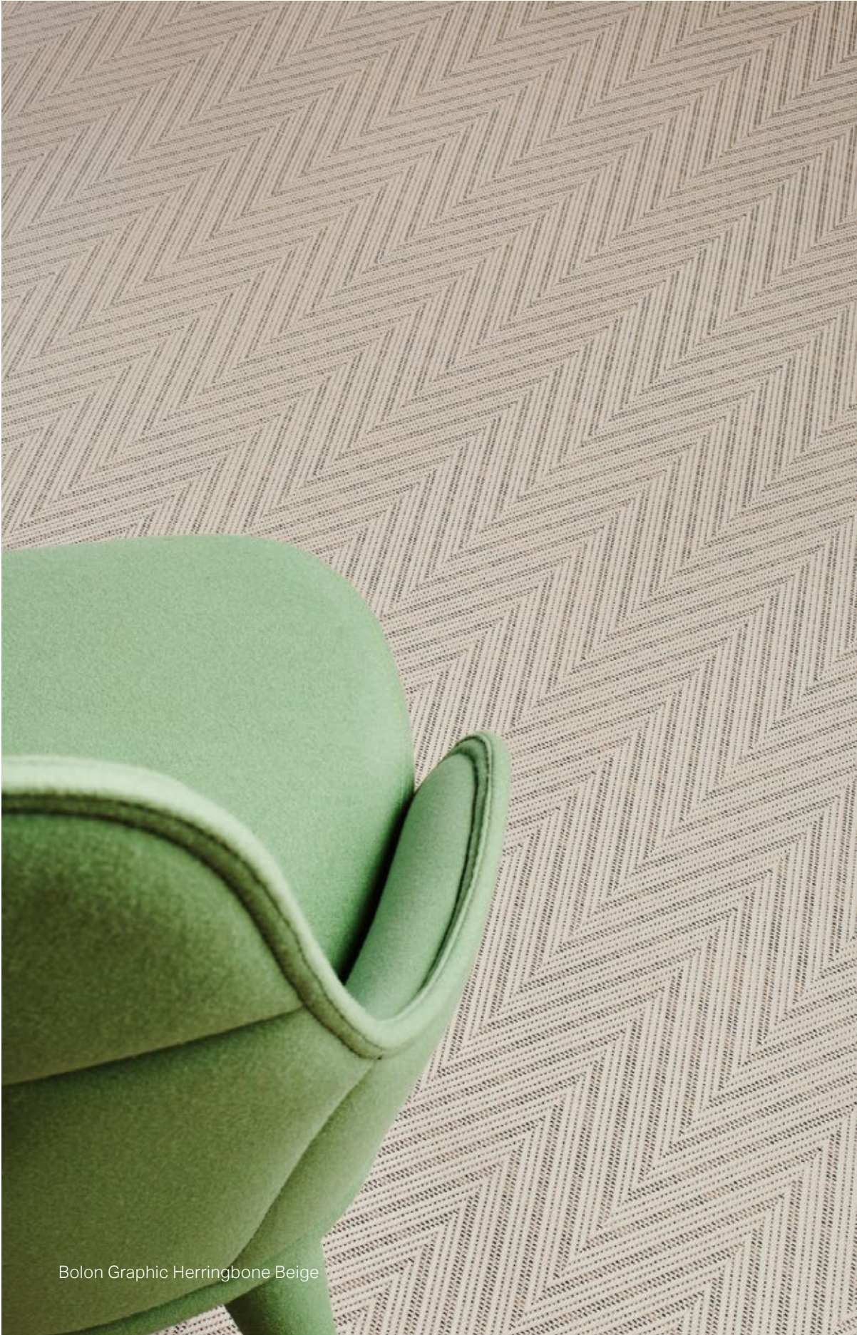
Bolon Graphic Herringbone Beige