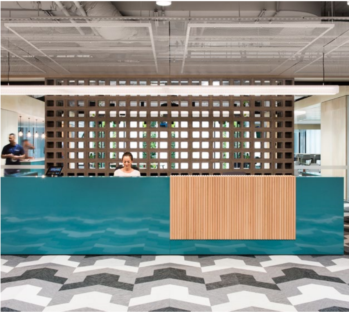
Bolon Studio™ Wing: Artisan Ivory, Botanic Osier and Botanic Picea