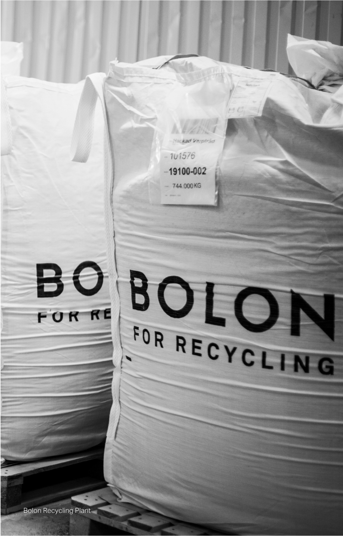
Bolon Recycling Plant