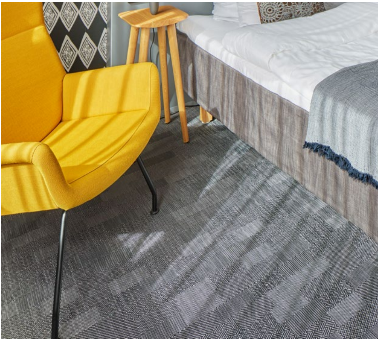
Bolon Graphic Checked