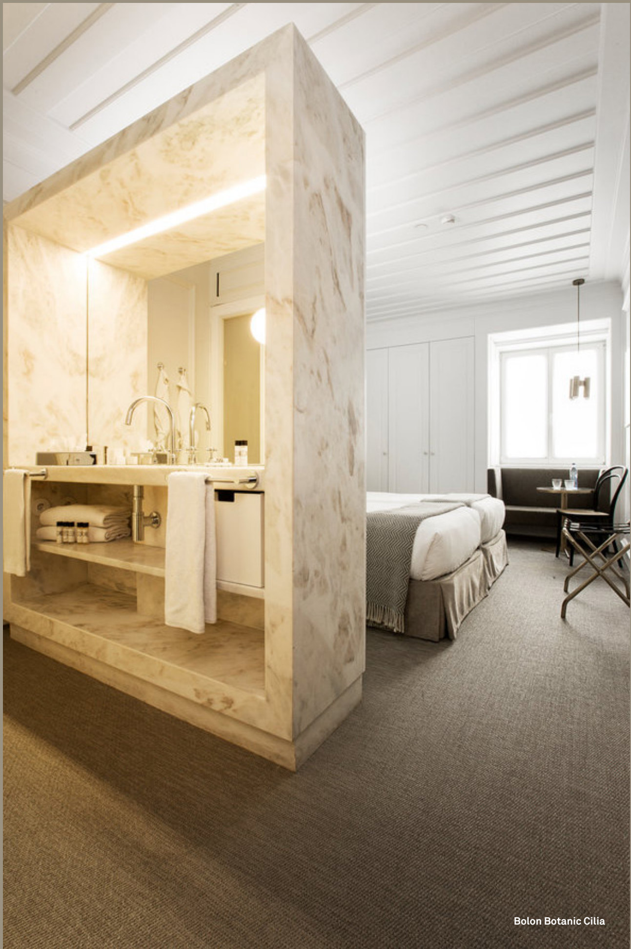
Bolon Botanic Cilia