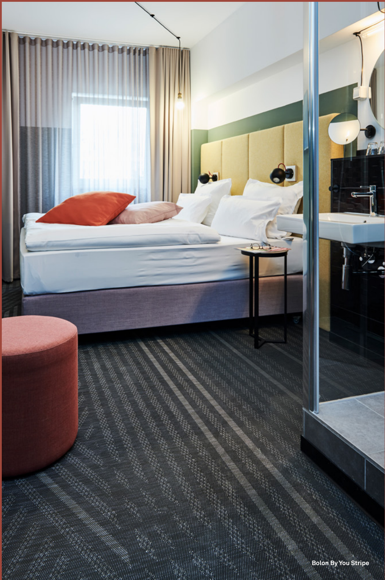
Bolon By You Stripe