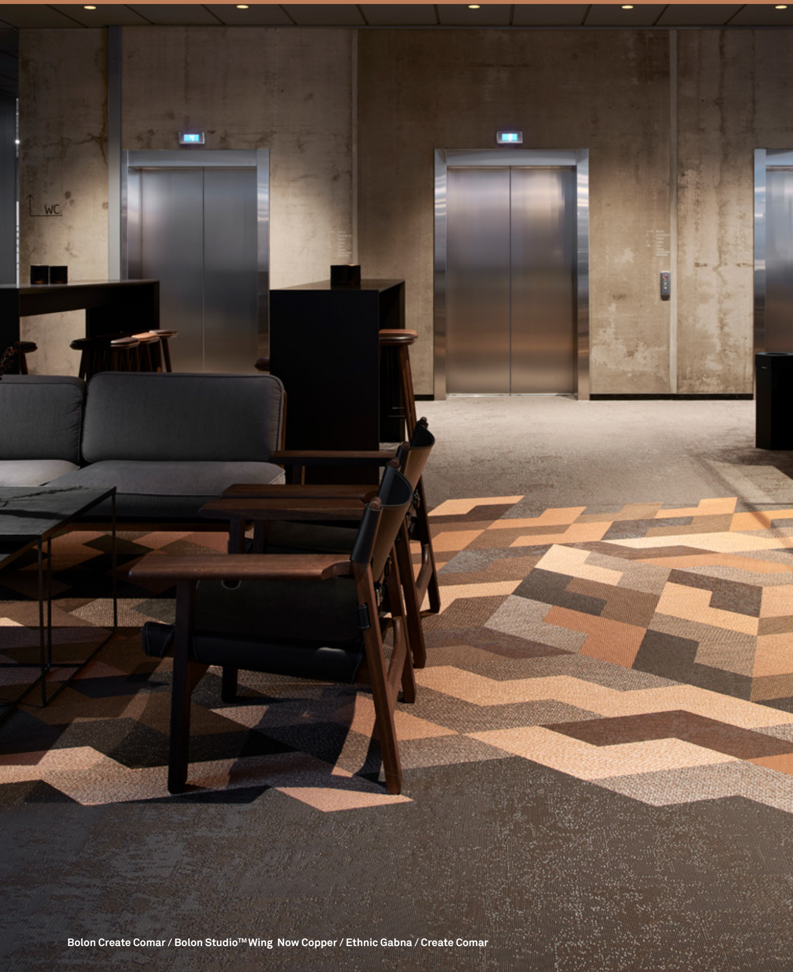
Bolon Create Comar / Bolon Studio™ Wing Now Copper / Ethnic Gabna / Create Comar