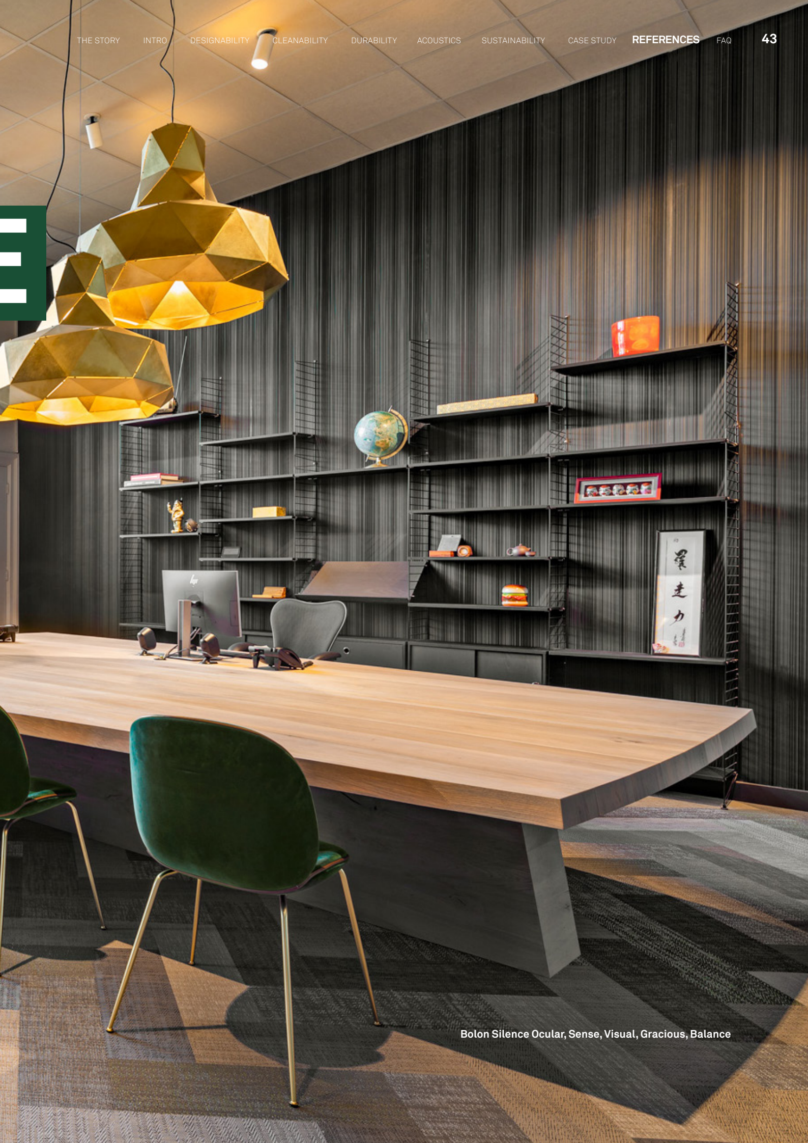
Bolon Silence Ocular, Sense, Visual, Gracious, Balance