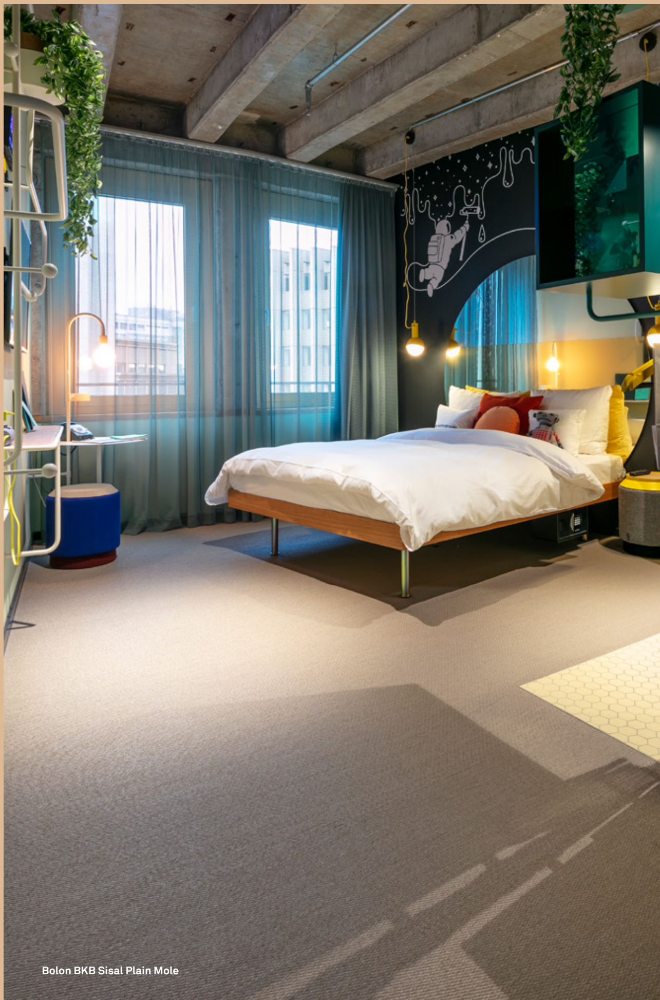
Bolon BKB Sisal Plain Mole