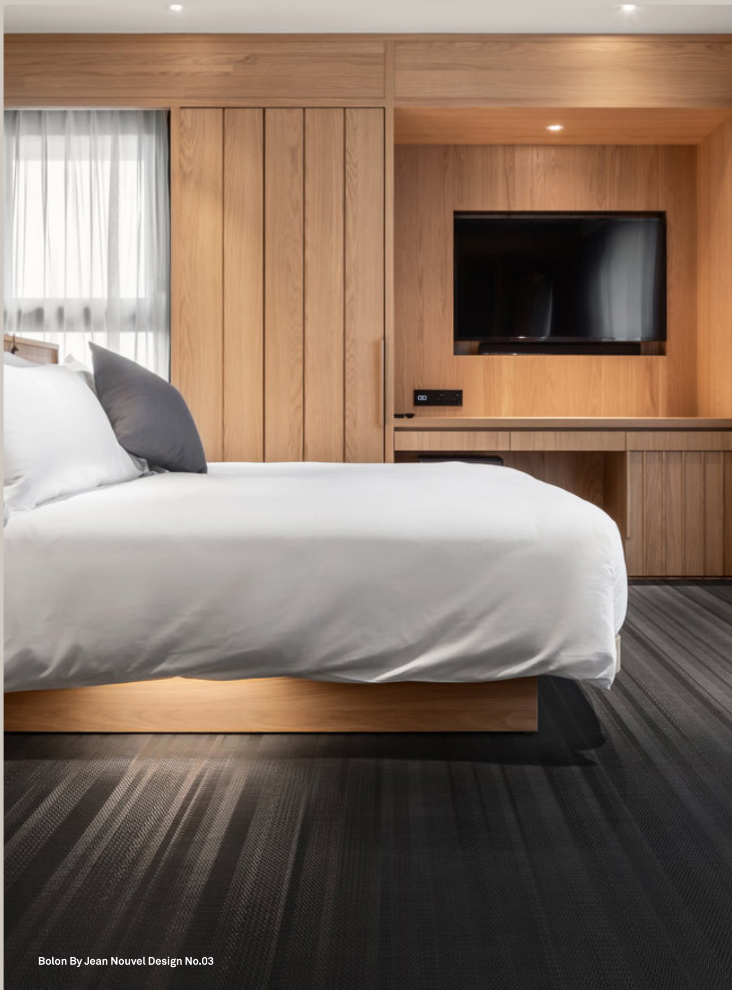
Bolon By Jean Nouvel Design No.03